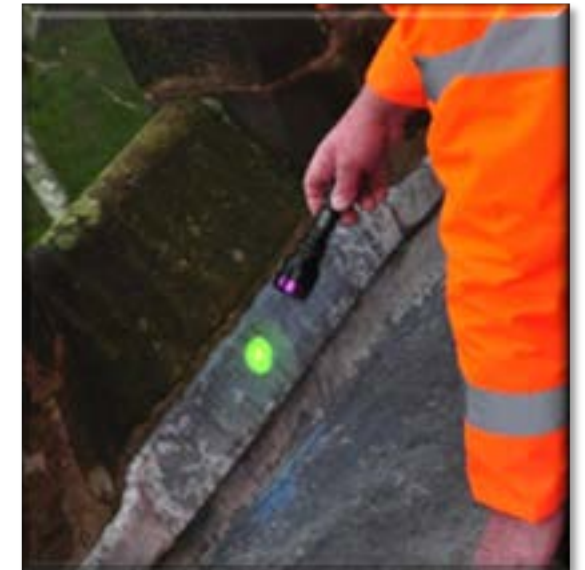
SmartTrace liquid shown glowing under UV light on a lead roof.