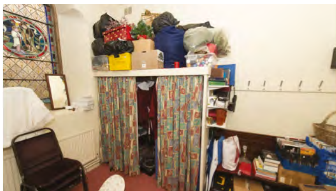
Storage rooms or cupboards can help keep clutter off floors and walkways.