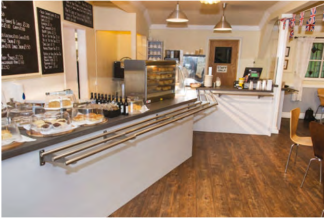
Many historic properties feature a cafe which can present a risk from spills.